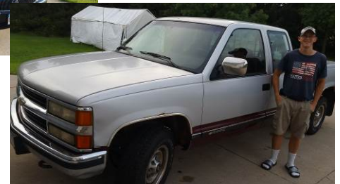
Chevrolet Silverado 2500

(he is keeping this one for now as his daily driver)