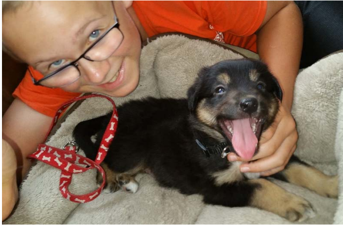
Buddy Boy Schwieger

2016 brought an addition to our family in the form of a puppy!