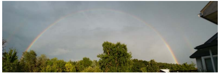
Double Rainbow at our house