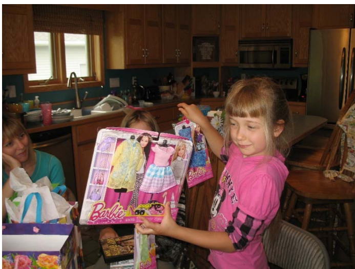
Birthday party in Fargo